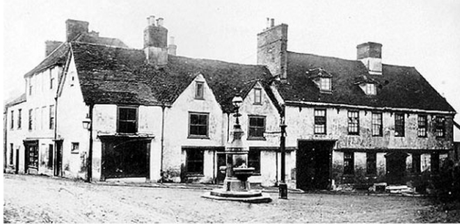
The extensive and very well appointed Crown Inn finally closed in 1872 and was demolished in 1898

At a session of Sewers holden on Wednesday the ninth day of June In the Year of our Lord One thousand Seven hundred and Thirty Six at the Crowne Inne in Hockerill in the Parish of Bishops Stortford in the said